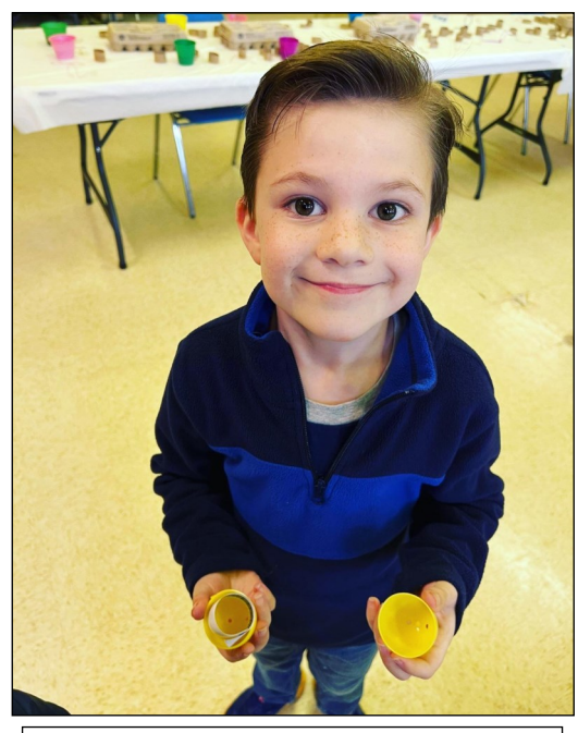
Got Easter eggs?

All who wish may come up to the rail after the service for prayers and anointing.